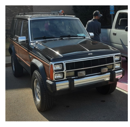
October was a busy month for car shows. The top four pictures are from Odenville.