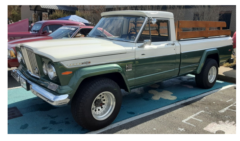
The pics below are from a "Pell City Event". Check out the Jeep parking.