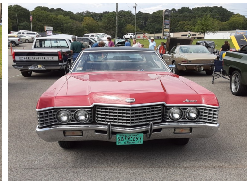
The pics below are from the recent "Cars by the Creek" in Montevallo , AL