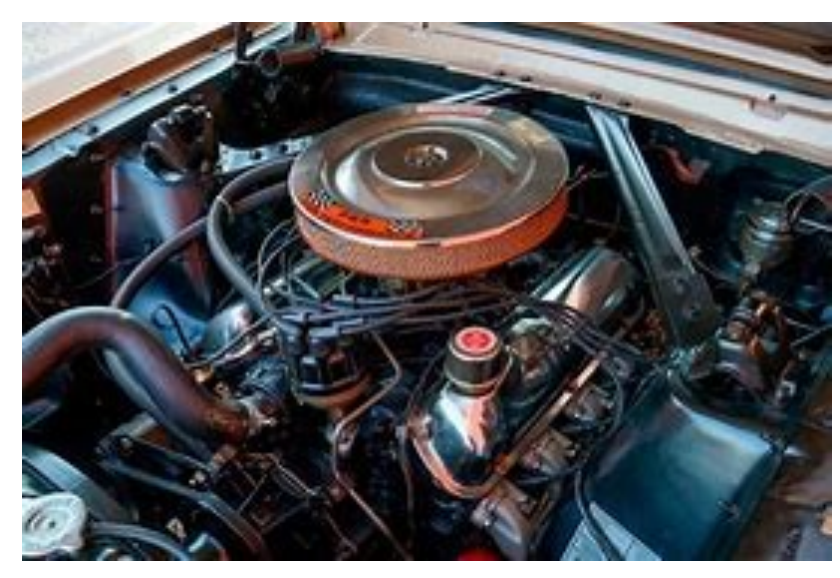
Pictured left is a Ford 289 V-8 HiPo engine.

Many 289 V-8 Fords can be found in our region at Cruise-Ins and Car shows. When asked what engine is in the car, Ford owners will state, it's a 289. I wonder if the response will be, "So it's Studebaker engine."