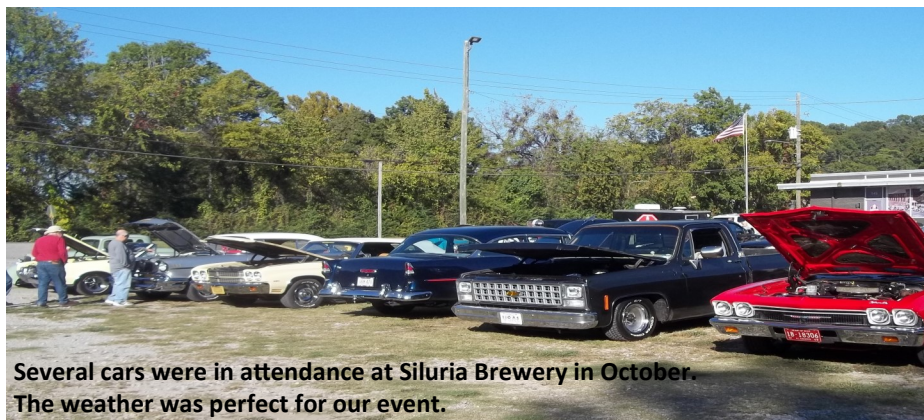
Several cars were in attendance at Siluria Brewery in October. The weather was perfect for our event.