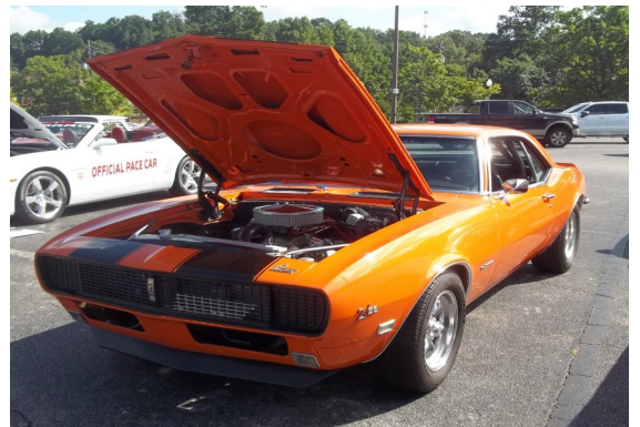
Pictured to the left and right are some of the vehicles that attended Dixie Vintage First Saturday Cruise-In at Hoover Tactical in August.