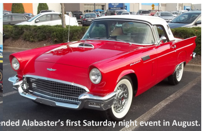
Pictured are two examples of the many fine red cars that attended Alabaster's first Saturday night event in August.