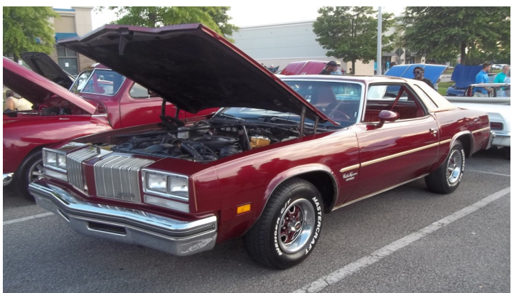
Pictured above is yet another sample of fine cars that were in attendance at McCalla's second Saturday night event in August. It has been hot at each event this month but we have escaped the summer time popup thunderstorms so far.