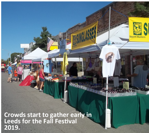
Crowds start to gather early in Leeds for the Fall Festival 2019.