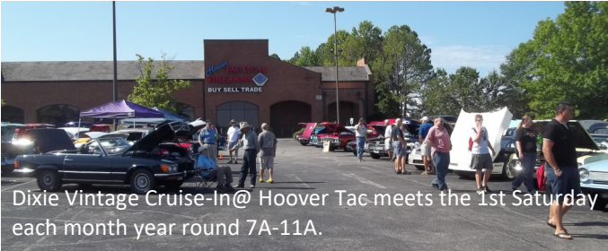
Dixie Vintage Cruise-In@ Hoover Tac meets the 1st Saturday each month year round 7A-11A.

Visit http://WWW.DVAAC.COM for more information about Dixie Vintage Antique Automobile Club.