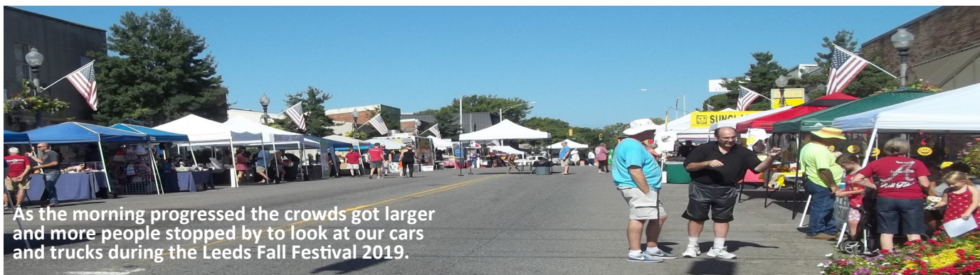
As the morning progressed the crowds got larger and more people stopped by to look at our cars and trucks during the Leeds Fall Festival 2019.