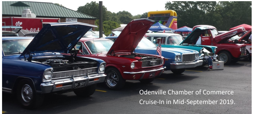
Odenville Chamber of Commerce Cruise-In in Mid-September 2019.