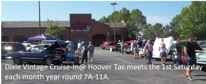
Dixie Vintage Cruise-In@ Hoover Tac meets the 1st Saturday each month year round 7A-11A.

Visit http://WWW.DVAAC.COM for more information about Dixie Vintage Antique Automobile Club.