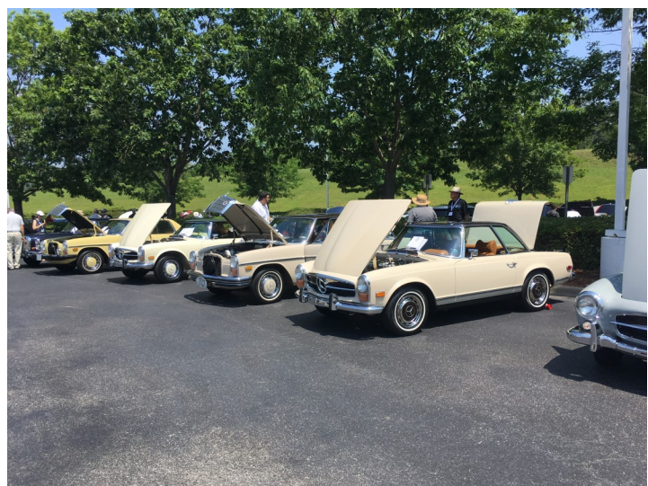
Ralph Neely's 1969 Mercedes-Benz 280SL