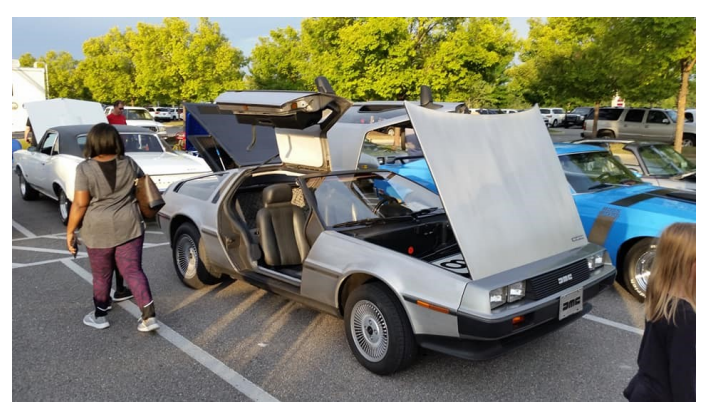
The Dixie Vintage Club attended National Night out in Hoover the first week of August.